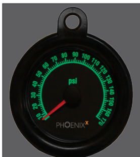
Backlit dial/needle is easy to read in low light conditions

To Order 800-998-9897 myerstiresupply.com